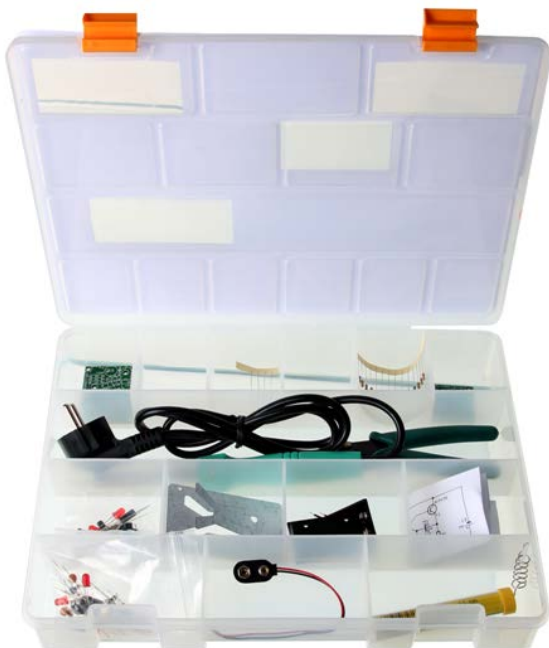
Handy storage box