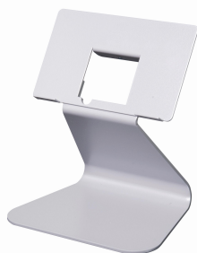
SOB-M Desktop adaptor