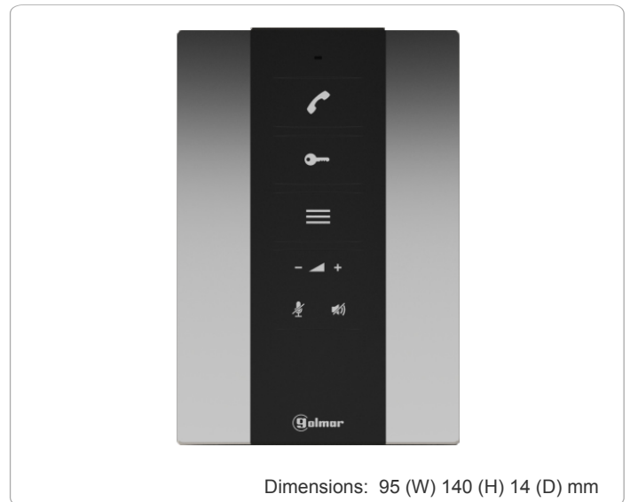
Dimensions: 95 (W) 140 (H) 14 (D) mm

The high fidelity FULL duplex audio communication makes this product exclusive.